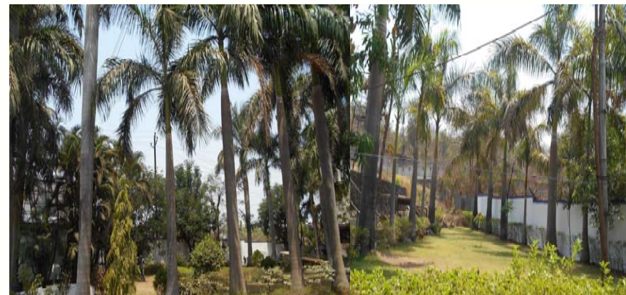
Greenery at factory Premises