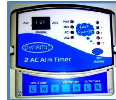
Use of LED & AC Timer at Factory & Office