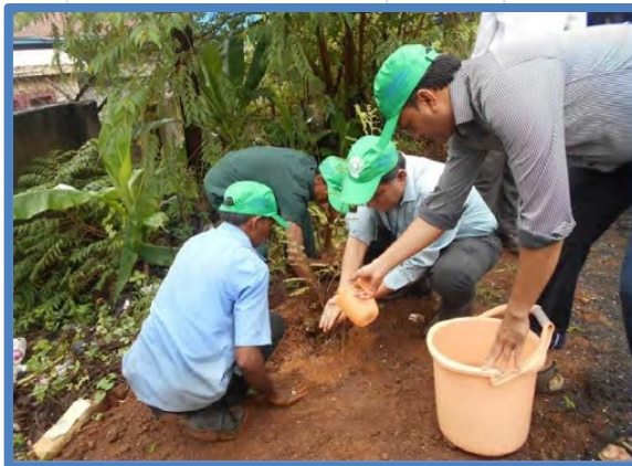
Tree Plantation at our Factory Premises