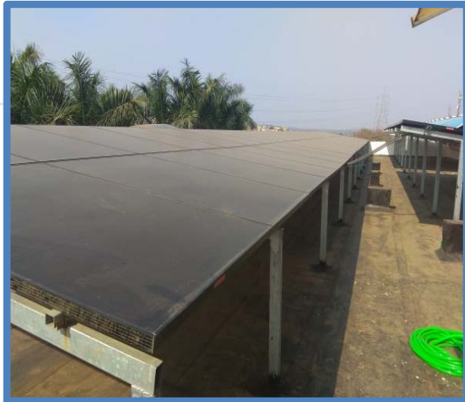
50 KW Solar Panel installed at Factory