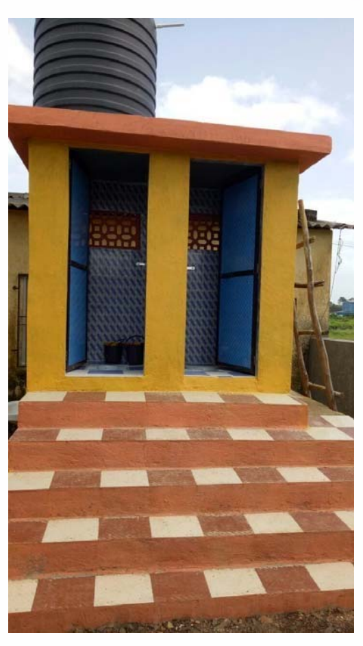
Modular Toilet at Mundhewadi Zila Parishad School, Asangaon