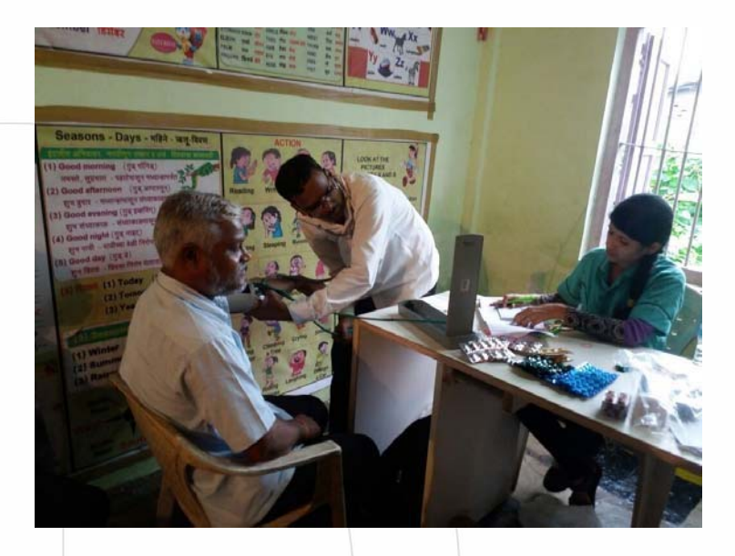
Medical Camp for Villagers