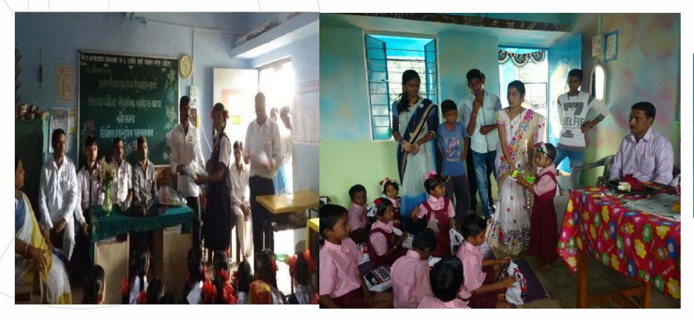
Digital Classroom at Asangaon School