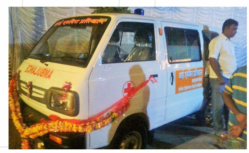
Ambulance to Villagers at Asangaon